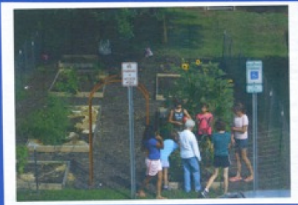
Westminster Boys and Girls Club Garden