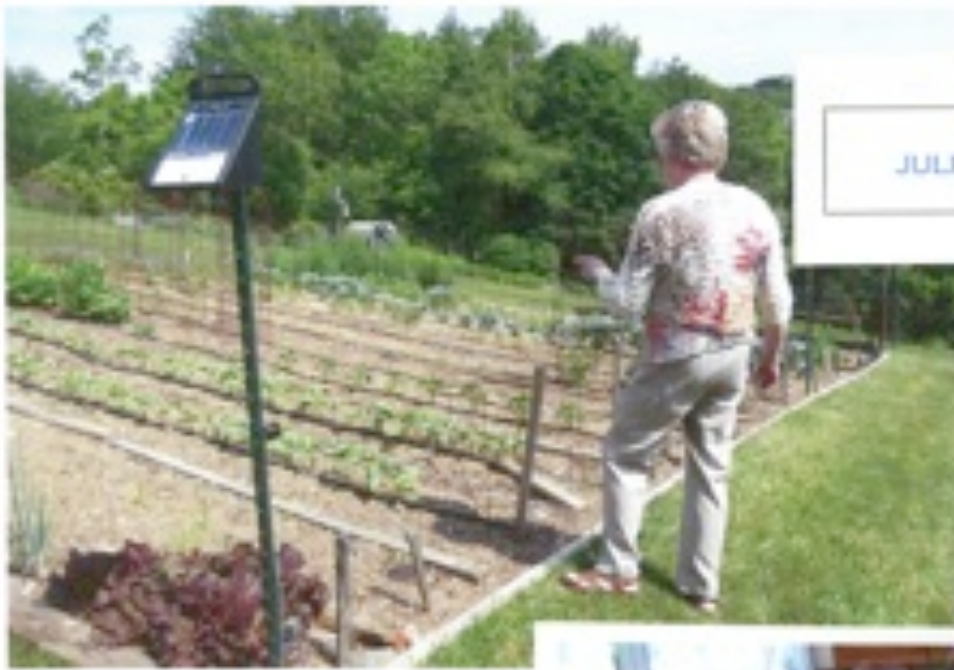
JULIA'S IMPRESSIVE VEGGIE GARDEN