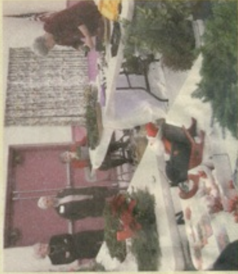
Members of Carroll Garden Club arrange greenery at the club's December meeting.

"Most people join a garden club because they like to be with those who have a common interest in gardening or because they wish